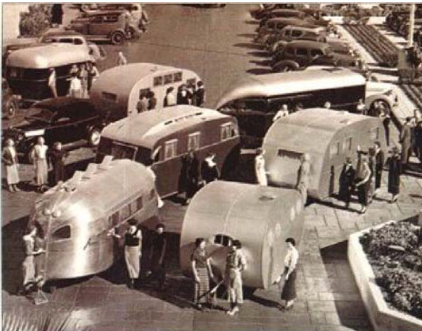
ad from 1935 trailer show.

Wisconsin RVers will be visiting State Fair Park this month for the Milwaukee RV Show. The show will host 100 exhibitors including Ewald Airstream from Franklin. Last year, members from the WI Unit