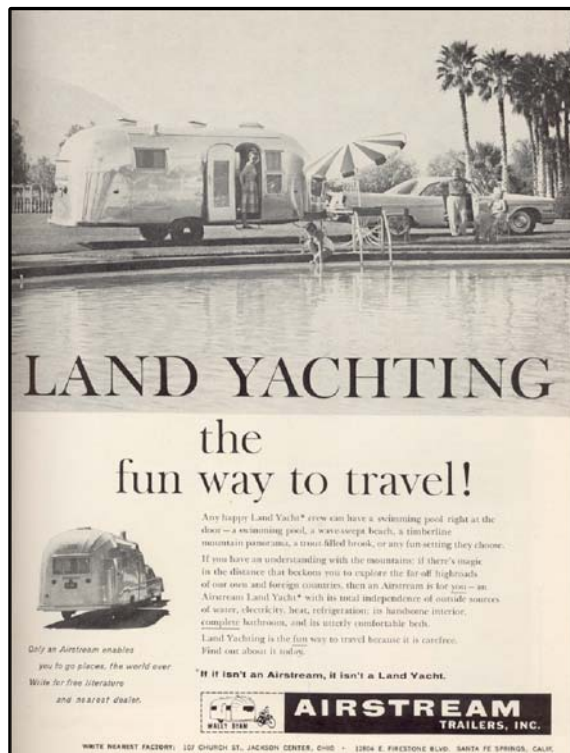
Advertising for the 1959 Airstream