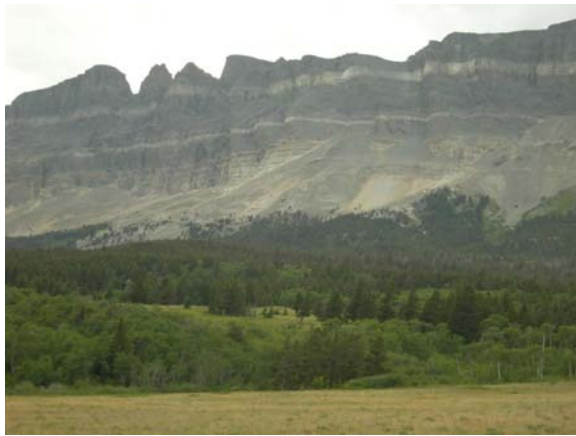
Outside of Teddy Roosevelt National Park

little private park. The next five days are glacier national park, and then into Canada for a visit to our neighbors to the north. The travel, while enjoyable, has been mostly centered on getting out this far. Most of the rest of our time keeps our travel days well below two hundred miles, so we should get a chance to see a lot more along the way.