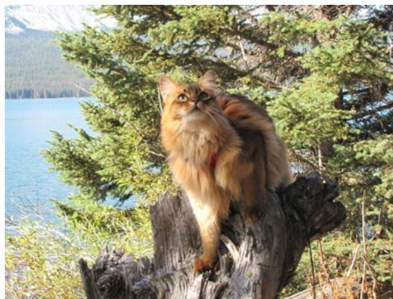
Ruby the cat.