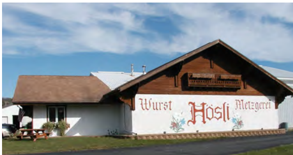
A New Glarus butcher shop. (English also spoken!)

We will be camping at the Sweet Minihaha Campground in nearby Brodhead. See the Swiss Historical Village, the very Swiss historical district of New Glarus, and of course, the New Glarus brewery! Brodhead also has a historical museum, Amish shops, and , at the time of the rally, will have a traveling Smithsonian exhibition!