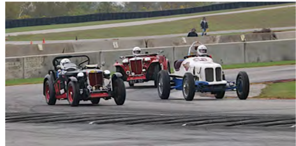
Vintage sports cars racing, Road America, 2010

Back by popular demand, the Region 7 VAC Rally will be at Road America, Elkhart Lake, WI, September 9 – 11.