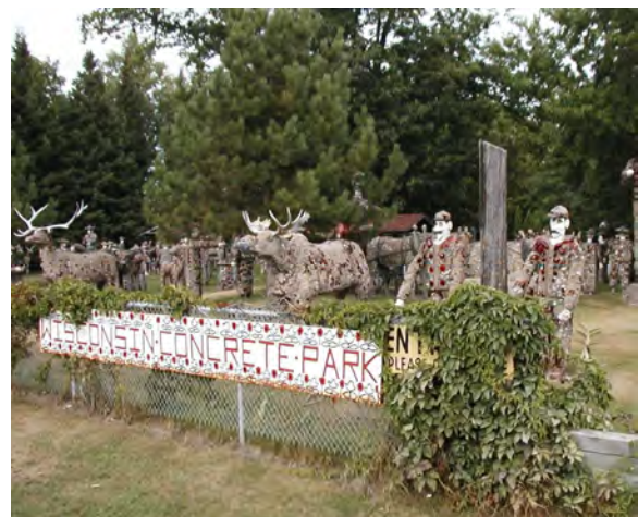
Wisconsin Concrete Park – part of weird Wisconsin .