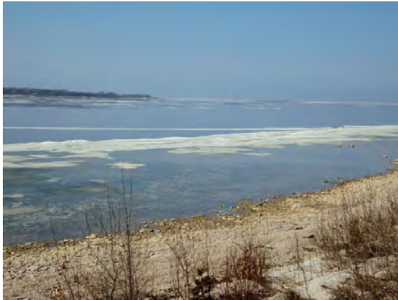
A little chilly for swimming, but most of the ice is gone!

The gathering took place at Tennison Bay Camp Ground in Peninsula State Park, near Sister Bay.