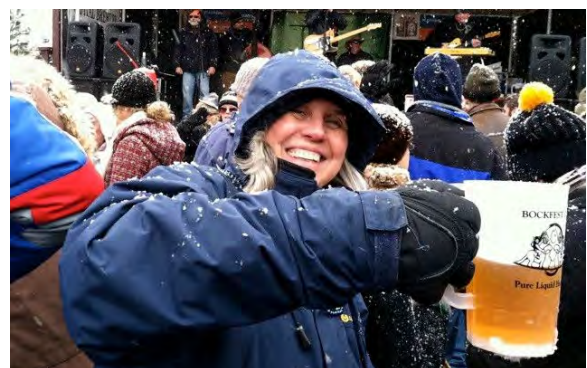
Hey—the snow is diluting my beer!

Bockfest. For people who like their beer cold.