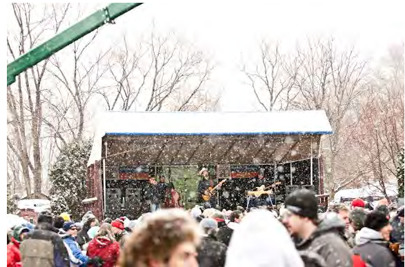
Look at that snow!

Now of course, there is the little matter that it was snowing like crazy that weekend, but Ed and Sandy weren't going to let a little thing like that stop them.