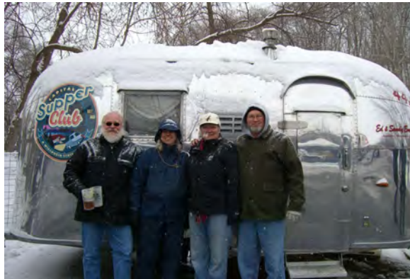
Hardy Bockfest goes with snow-capped Airstream.