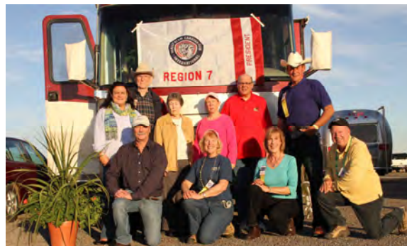
Region 7 attendees at the Mid Winter IBT.

However, the picture at the top of the right column does show Region 7 attendees at the Mid-Winter IBT. Full details of both pictures are included in the March, 2011 Region 7 newsletter.