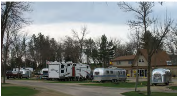
Disregard non-Airstream 5 th wheel in the middle!

The Dells KOA welcomed us back with their usual outstanding hospitality, and still more refinements to their popular party room—including British flags in honor of the royal wedding!