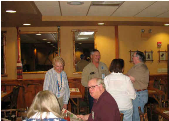
Fun, fellowship and adventure! (Mostly the former.)

Once again we had the Moosejaws's Rathskeller party room to ourselves, with bar (and video arcade) conveniently adjoining.