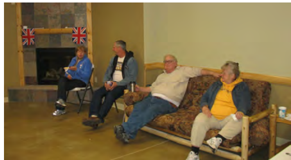
Chillin' on Sunday morning