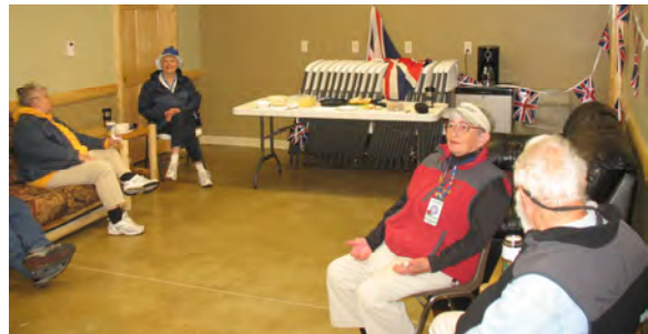
Sunday morning breakfast in the party room