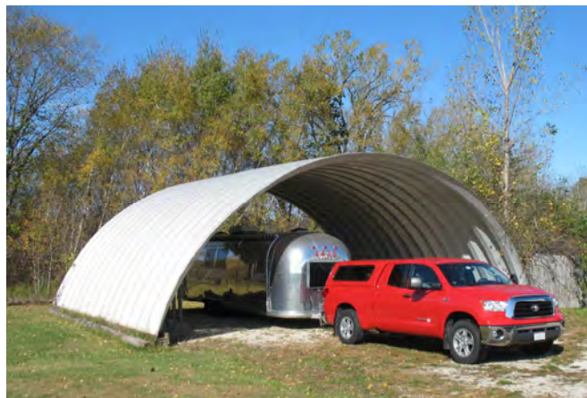
The first Airstream is parked in a hangar at Airstream Acres.

(The previous owners are building a new house on a lot on a larger airport just a few miles away.)