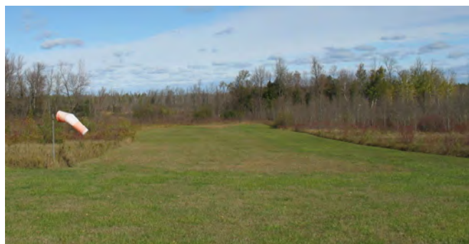
"Flying Cloud Four Four Two Five is cleared for takeoff on runway Three Six, wind Two Seven Zero Degrees, Five."

Actually, Ed and Sandy are planning to plant most of the land in fruits and vegetables and join the thriving Door County agricultural industry. (Do Brussels sprouts come from Brussels, Wisconsin?)