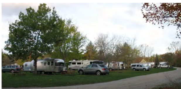
A gaggle of Airstreams at Tranquil Timbers.