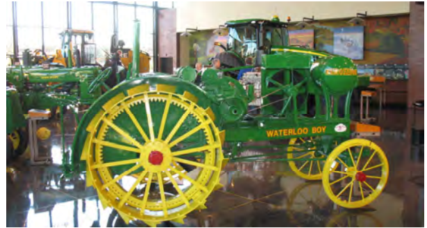
Antique tractor on display at John Deere Pavilion.