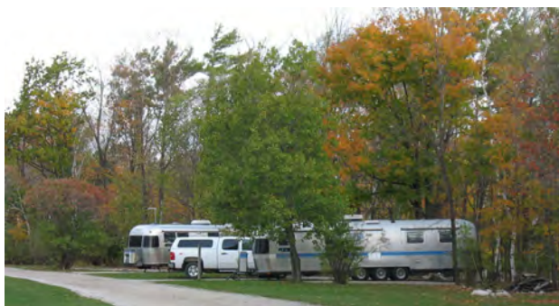
Leaves just starting to turn, mid October.