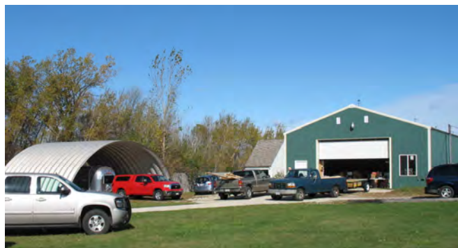
A scene of general confusion as previous owners move out while Ed & Sandy begin to move in.