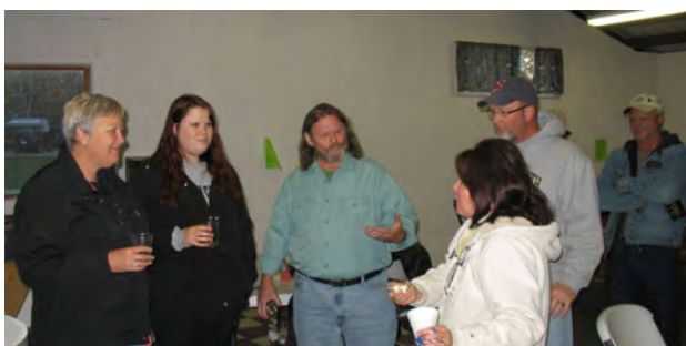
Ever-popular happy hour