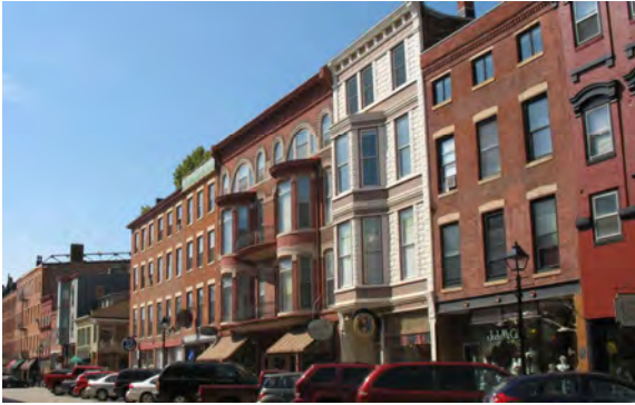
Galena's historic Main Street now houses upscale emporia.

After the Apostle Islands rally in September, Barb and I wandered into northwestern Illinois to sightsee and contemplate a future rally. Our first stop was Galena, IL, a lead mining boom town in the early 1800', then a major Mississippi River port, and now a tourist destination.