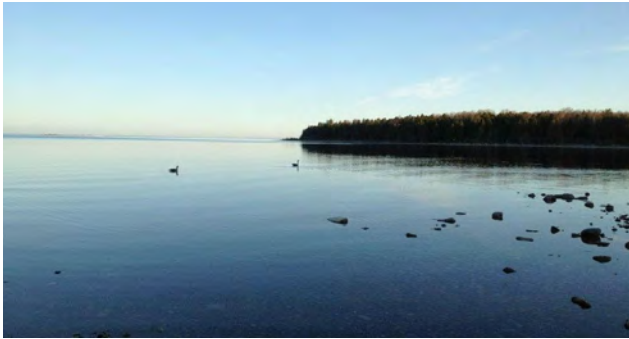
Green Bay smooth as glass.

Ed & Sandy Emerick hosted their annual Easter camp out at Peninsula State Park. As can be seen from the pictures, they had beautiful weather for it!