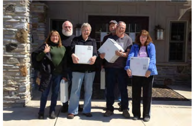
Hey, it's cheaper by the case!

Camp outs like the Easter Camp Out are perfect for sitting around the fire (whether it's lit or not) and r-e-l-a-x-i-n-g!