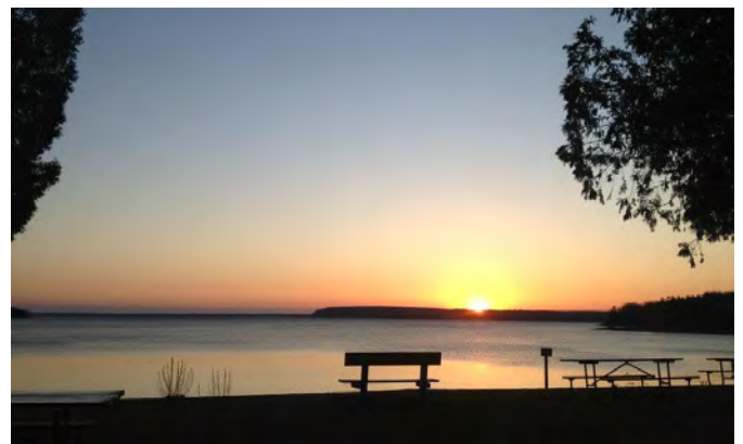
Enjoying a beautiful sunset over Green Bay

Thanks, Ed & Sandy, for another great camp out!