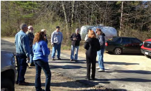
The gang's all here.!

No trip to Door County is complete without a visit to the Door Peninsula Winery! (And now, distillery .)