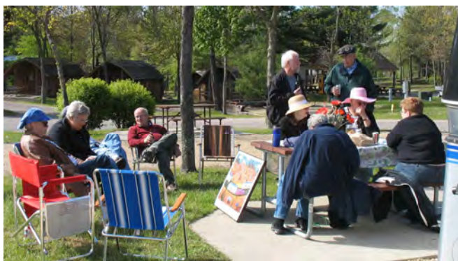
Happy hour—the centerpiece of any WBCCI activity!