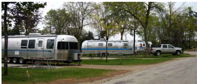
Downstairs – the high rent district (with pull-thru spaces).