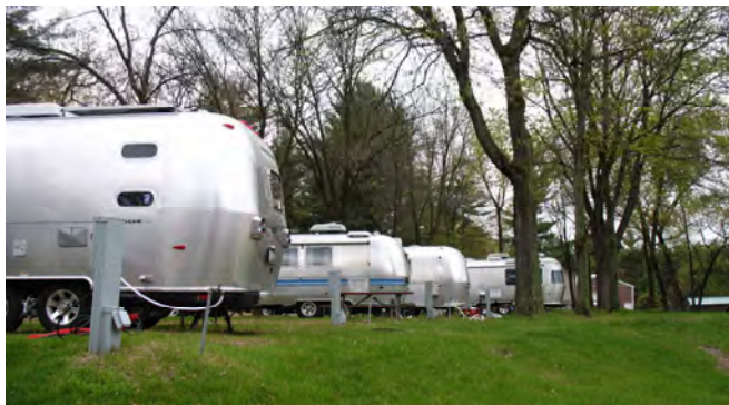
Upstairs – the low rent district (with back-in spaces).