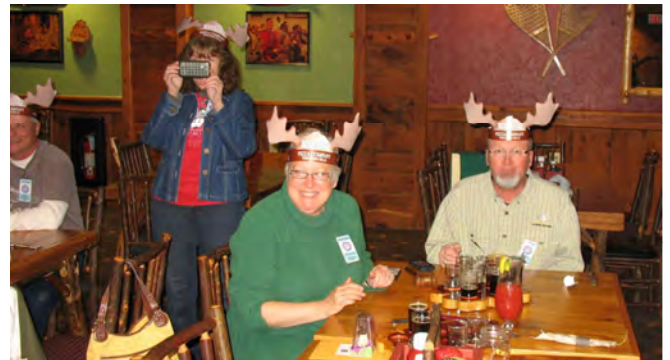
President & First Lady Moose (with 10-glass beer sampler)