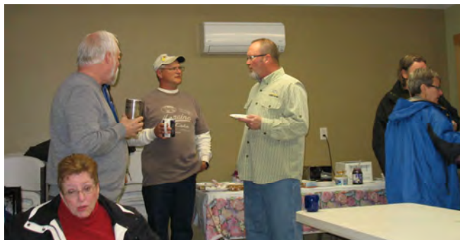
Unit opinion leaders confer at breakfast.