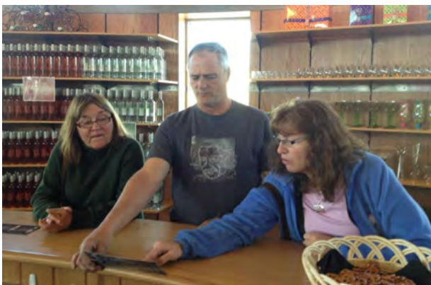
Studying the menu in the tasting room.