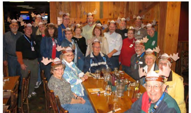
It's a WBCCI Unit, not a Moose Lodge!

All in all, outcomes were very satisfactory. Everyone had plenty to eat and drink, the business meeting was concluded expeditiously, and everyone made it home all right. (Those of us camped at the KOA didn't have very far to go!)