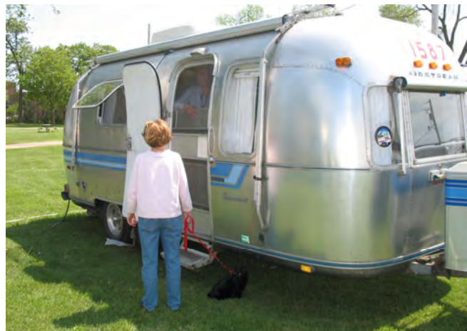
Heidi Manak (with cat, outside trailer) talks with Barbara Sellers (with dogs, inside trailer)

Arlene really pulled out all the stops on food for this rally! Friday evening we repaired to a local club for an excellent all-you-can-eat fish fry, then Saturday morning Arlene & Dick prepared a unique Green Eggs & Spam breakfast. (In case you are wondering, the Green Eggs were scrambled eggs with sautéed spinach. The spinach adds a nice crunchy texture. The recipe indicated that green food coloring was optional, but, tastefully, Arlene did not opt.)