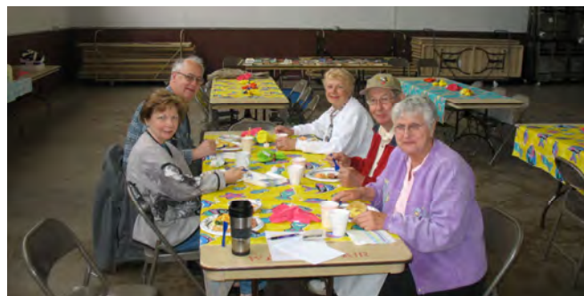
A small but congenial gathering.

On Saturday everyone took off on their own to see nearby attractions, like the upscale town of Lake Geneva (practically a suburb for Chicago money), the Geneva Lake Museum, Yerkes Observatory at Williams Bay, and numerous other sights. Ice cream shops and the Lake Geneva Pie Company also got their share of visits.