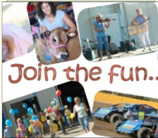
THE HISTORIC SPICER CASTLE ON GREEN LAKE - 1895

DEMOLITION DERBY THURS. AUG. 9 & SAT. AUG. 11, 2012