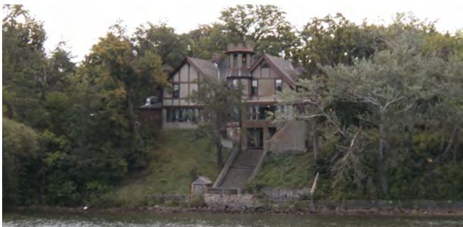
Spicer Castle on Green Lake