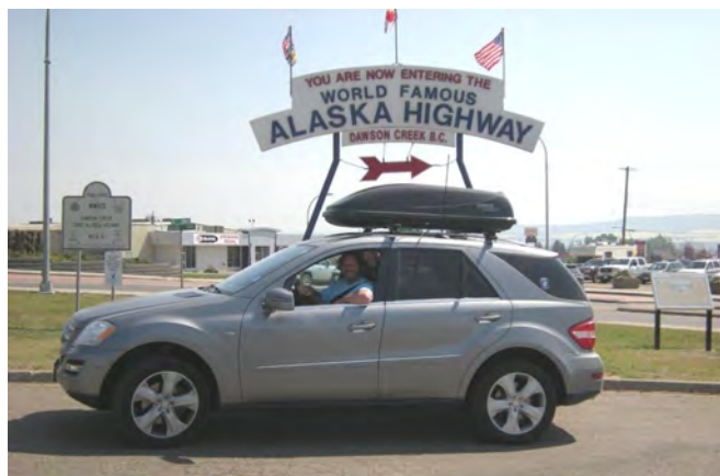
Start of the Alaska Highway at Dawson Creek, BC