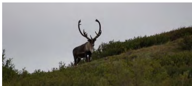
Caribou in Denali National Park.

We met up with three people we knew from the Cajun caravan, and thousands who know Ed and Sandy. We also met a few that knew various other members of the Wisconsin unit. The campgrounds mostly have full hook-ups, though there have been a few nights of limited power and having to use internal water. The scenery is beautiful, the train ride to Skagway was spectacular.