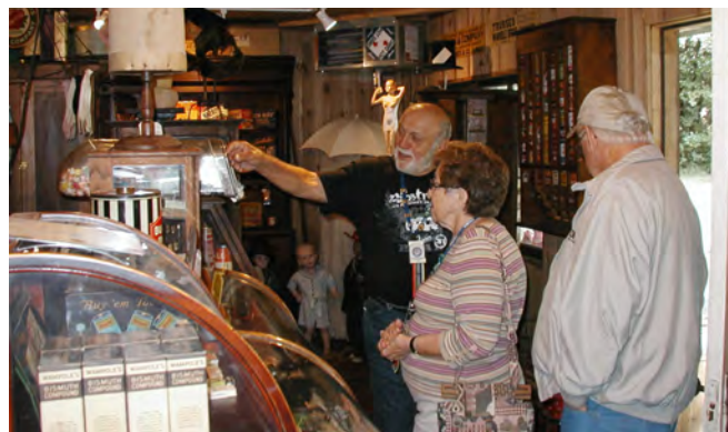
Nostalgia tripping at Sheehan's Country Store.

Friday's festivities were finished off with a trip to New London to watch the pre-run antique car parade. Those willing to get up early enough returned to New London on Saturday morning to watch the official start of the 120 mile run at 7 AM, followed by a pancake breakfast. Then we were off to tour two little-known private museums, Sheehan's Country Store and Levin's Raptor Ridge.