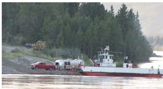
Boarding the ferry to cross the Yukon River

The 34 trailers and four motor homes break up into small groups for the moves, with most days having less than two hundred miles travel. Of course one of the shortest days of travel in mileage was one of the worst in road conditions. Gas and fuel are expensive, especially in Canada, as much as six dollars plus per gallon. Prices are not as bad in Alaska. As we were told by locals, the cost of transport to the places of the Yukon and the gold fields of Alaska is tremendous.