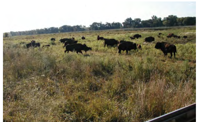
Buffalo herd as seen from tour bus window.

Thursday morning, members who arrived Wednesday went on the boat tour while the rest of us went on a tour of the J&R Bison Ranch, where the owner regaled us with stories of buffalo ranching. Bison are wild animals, not domesticated, and can't be herded like cattle. If they decide to go someplace, the best thing to do is get out of their way!