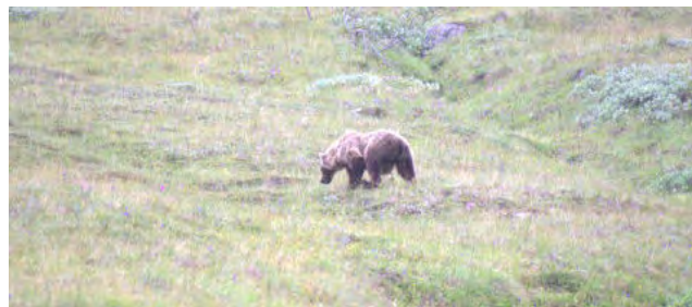
"If you're gonna go bear, go grizzly!"

The 34 trailers and four motor homes break up into small groups for the moves, with most days having less than two hundred miles travel. Of course one of the shortest days of travel in mileage was one of the worst in road conditions. Gas and fuel are expensive, especially in Canada, as much as six dollars plus per gallon. Prices are not as bad in Alaska. As we were told by locals, the cost of transport to the places of the Yukon and the gold fields of Alaska is tremendous.