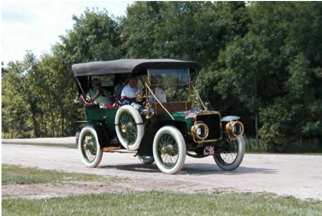
A 1907 Stevens-Duryea Six cruises into the campground.