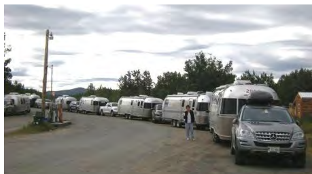
Ready to roll!

For us personally, the big adjustment is traveling with a group, and staying in private campgrounds. We usually camp by ourselves in public lands.