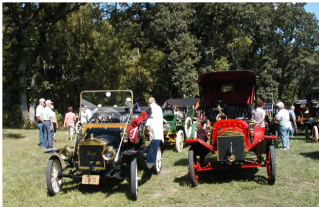
A gaggle of antique cars in our Happy Hour area!