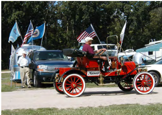
A 1912 Maxwell amongst the Airstreams.

trailers and talk with us. Afterwards we all went over to the American Legion (only about a mile away) for a buffet lunch. As you can imagine, cross-country touring in century old cars can be quite an adventure, and the owners had many great stories to tell.