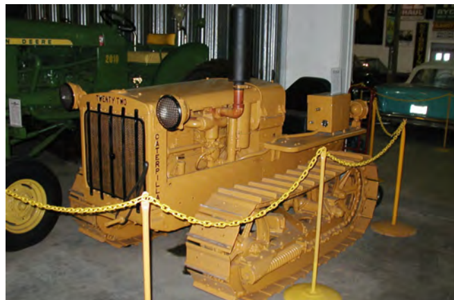
Early Caterpillar 22 at Schwanke's Tractor Museum

Friday was a grand tour of local attractions including such places as the Kandiyohi County Historical Museum and Schwanke's Tractor Museum, a huge collection of antique tractors and cars, including some one-of-a-kind models.