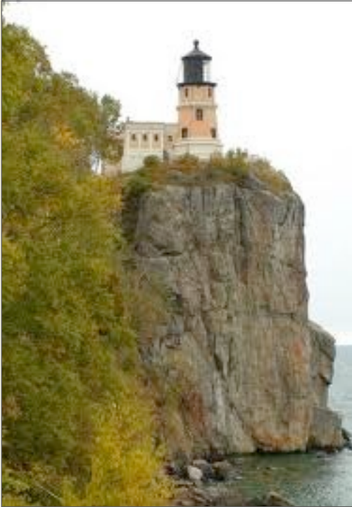
SPLIT ROCK LIGHTHOUSE