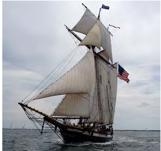
The topsail schooner Lynx under full sail.

Anyone interested in doing this, please call me before March 22 at 320-295-1117 and I will reserve a block of tickets for us. Or, you can purchase your tickets on your own on Monday, April 1 after 10 AM either by calling 1-877-435-9809 or online at www.visitduluth.com