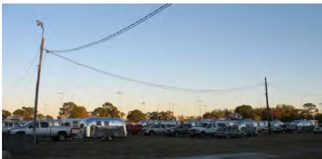
Vintage parking—apparent from the polished trailers.

The FSR always has a good selection of vendors and seminars. This year's included everything from WBCCI and Airstream, Inc. maintenance seminars to a Dutch oven cooking class and a Florida concealed weapons permit class. (We don't have a Dutch oven, but we did sample the product, some chocolate concoction. Wonderful!)