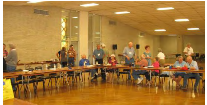
VAC potluck dinner in the Potter Building

As usual, Vintage Airstream Club had a strong presence, with a potluck dinner Friday and an Open House Saturday.