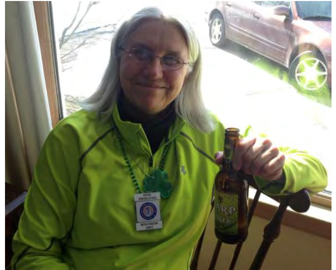
Wearin' o' the green—check! Shamrock—check! Harp Lager—check! Ready for St. Patrick's Day!