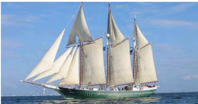
Schooner Denis Sullivan of Milwaukee

"In addition to onboard tours, Tall Ships® Duluth 2013 will offer the opportunity for visitors to sail on Lake Superior aboard the Privateer Lynx , S/V Denis Sullivan and the Schooner Hindu . Each vessel will sail several times daily beginning Friday, July 26, providing not only an educational glimpse into daily life aboard a tall ship, but also the grandeur of experiencing Lake Superior under sail."