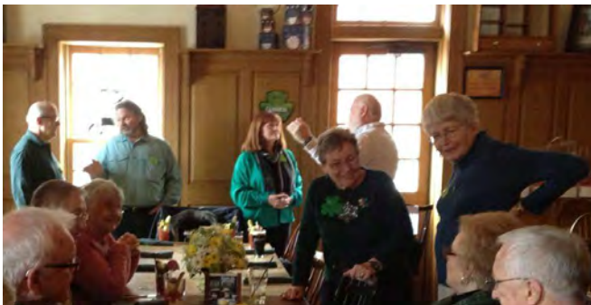
The luncheon gets underway with animated conversations.

Wells Street Tavern, the quintessential place to celebrate St. Patrick's Day!