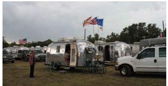
Another view of vintage parking. It was overcast most days.