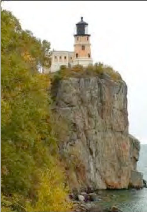
SPLIT ROCK LIGHTHOUSE