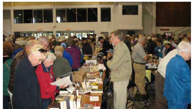
The flea market was well attended.

2013 was the last year for the WBCCI Florida State Rally. This year the Board of Governors voted to dissolve the corporation on account of insufficient volunteers to continue. But the event will continue as Alumaflamingo under the management of R & B Events, the organizers of the "Aluma" rallies—Alumapalooza, Alumafandango, and Alumafiasco (or something like that). You can make your reservations for next year at www.alumaflamingo.com .