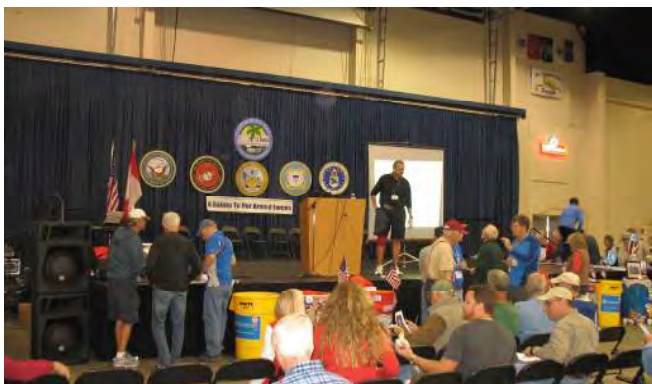
Airstream factory maintenance seminar in Robarts Arena.

Bates RV put on an RV show adjacent to the rally, bringing a large number of new Airstream models to tour (and want)!