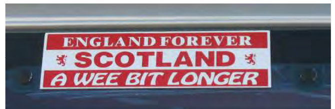
A little national sentiment on a B-190 in the vintage area.