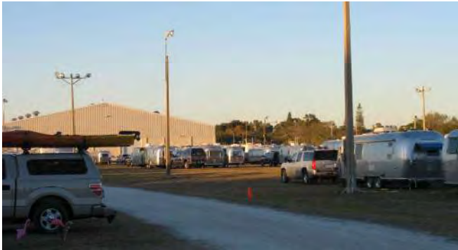
Trailers parked in orderly rows behind Robarts Arena.

The Wisconsin Unit and Region 7 were well represented at this year's Florida State Rally. The Florida State Rally's tradition of being the WBCCI's second largest rally was upheld with a total attendance of some three hundred and thirty trailers and motor homes.