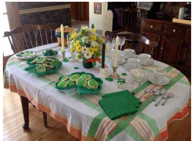
... where sits a bountiful table of St. Paddy's Day desserts!