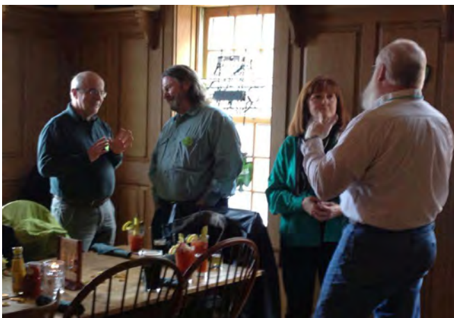
St. Paddy's day or no, Bloody Marys dominate the libations!