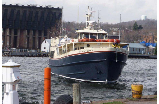
Marquette harbor cruise on the Isle Royale Queen III