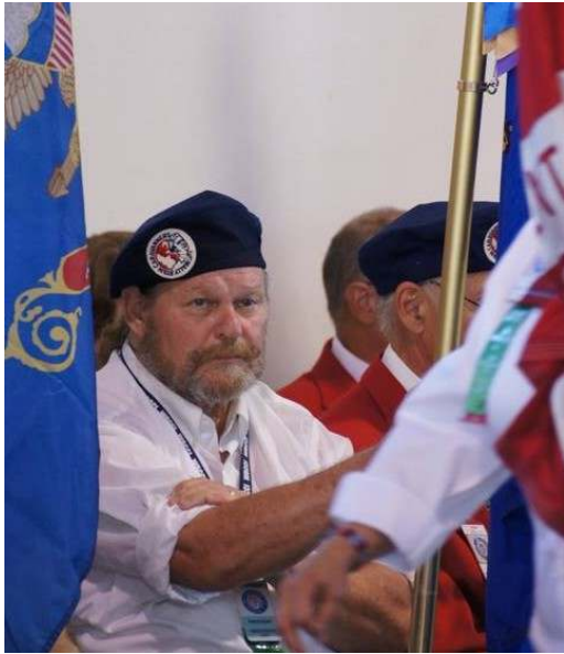
Our illustrious Unit President at opening ceremonies