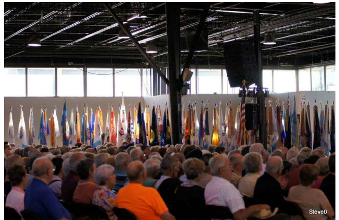
Spectacular opening ceremonies