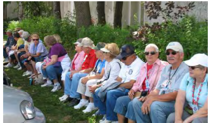
Waiting for the bus (and the boat).

found a comfortable wall to sit on to await the second bus! (Between construction on I-35 and the crowd in town for the Tall Ships festival traffic was terrible!)