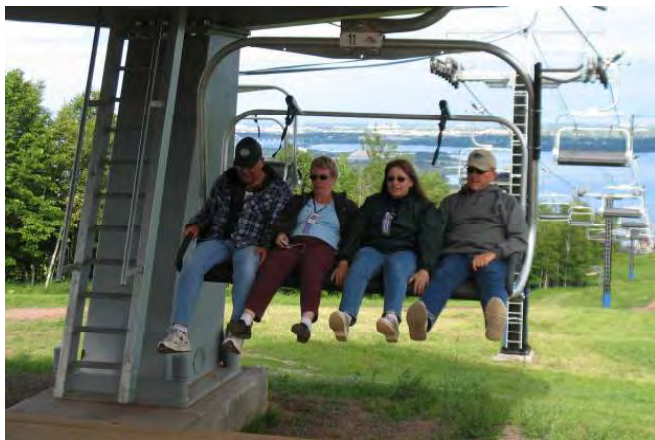
Feet up! Airstreamers prepare for landing on the ski lift.