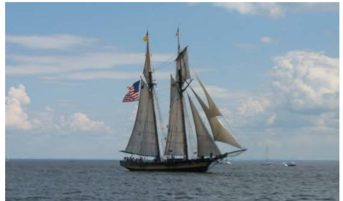
The Pride of Baltimore II leads the parade into the harbor.

The harbor tour boat was the place to watch the parade. The shoreline was lined with people—an estimated quarter million visitors the first day of the festival.