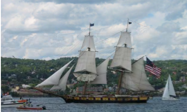
U. S. brig Niagara arriving at Duluth Harbor