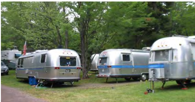
Airstreams every which way.

Needless to say every campground near Duluth was jammed for the Tall Ships Festival, including the Buffalo Valley Campground which had agreed to accommodate the rally. Airstreams were packed in as best they could be, 2 or 3 to a campsite, but there was plenty of water and electricity and the spacious Buffalo Junction party room for rally activities.