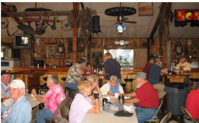
Breakfast at the Buffalo Junction .

Airstreamers went "first class", beginning the rally by watching the Parade of Tall Ships into Duluth Harbor from the harbor tour boat. It took two bus trips to ferry everyone from the campground to the harbor; those in the first busload