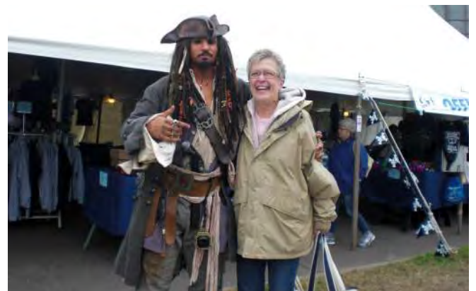
Aye, Lassie, it be Five Dollars for a Hot Dog and Five Dollars for a bottle of beer at the Tall Ships Festival! Why d'ye think we be called Pirates?!