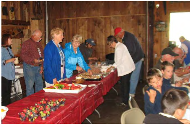
Sunday breakfast by the Wisconsin Unit