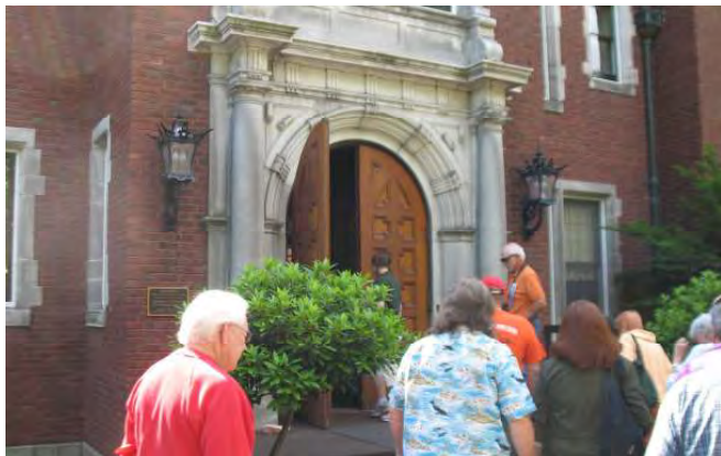
Entering the front door of Glensheen Mansion.