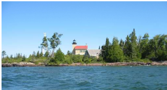
Copper Harbor Lighthouse as seen from the tour boat.

(Sandy and I will be heading back home Saturday morning 9-27, but caravanners may stay and play or travel to wherever your heart's desire.)