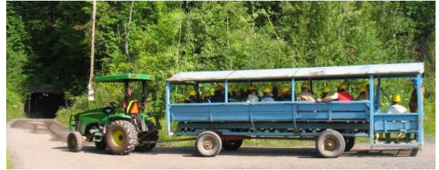
Tour tram entering the Quincy mine.

Several smaller copper mines and their surface works can also be seen. The Delaware mine offers self-guided tours http://www.delawarecopperminetours.com/