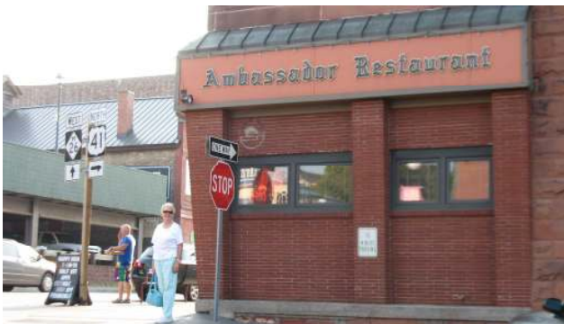
The Ambassador Restaurant in Houghton is a popular Michigan Technical University pizza pub.

Keweenaw Peninsula. The Keweenaw Peninsula is a treasure of forest, abandoned copper mines, and ghost towns. The town of Calumet was the center of copper mining on the peninsula. In the heyday of copper mining, a century ago, enormous wealth was concentrated there and it was seriously proposed as the state capital of Michigan.