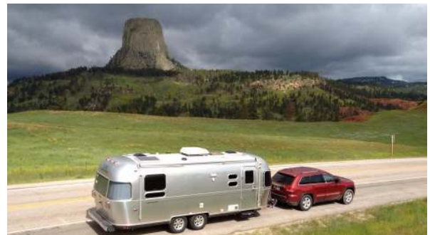
Devil's Tower National Monument in the background.

"I didn't make it to the Free Wheelers gathering because I left early from Gillette to spend a week in the Black Hills.