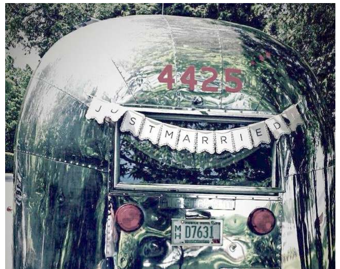
That pretty well sums it up!