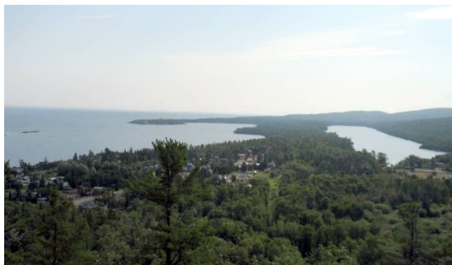
Copper Harbor and Lake Fannie Hooe from Brockway Mtn. Ft. Wilkins State Park is between these two bodies of water.

Friday, 9-26-14 – Travel to Copper Harbor. Camp at Fort Wilkins State Park