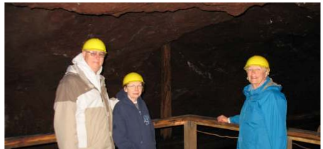
Touring the Delaware copper mine.

Several smaller copper mines and their surface works can also be seen. The Delaware mine offers self-guided tours http://www.delawarecopperminetours.com/