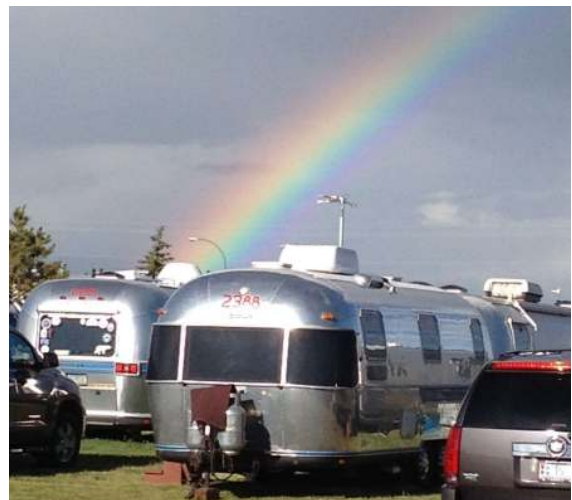
Rainbow after the storm.

"Most of all, it sure was convenient to have a power awning—the wind out there rose quickly and blew hard!"