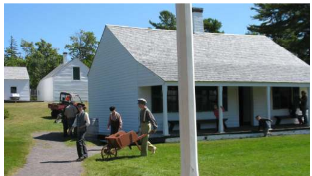
Costumed residents reenact daily life at Fort Wilkins.

Copper Harbor. It's only 45 miles from Hancock to Copper Harbor, but don't count on driving it in an hour! We will be staying in Fort Wilkins State Park, a very nice campground within easy walking distance of the restored fort, which is well worth seeing on its own.