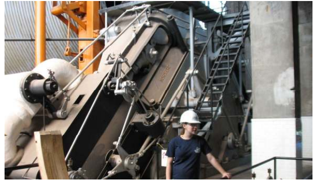
The Nordberg steam hoisting engine at the Quincy mine is the largest of its kind in the world.

Houghton-Hancock will serve as a base for exploring the Calumet copper mining area. The Quincy mine is the largest of the copper mines and offers mine and surface tours.