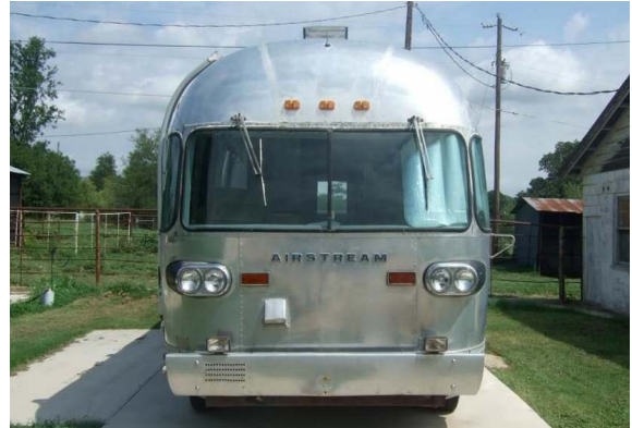
Boehmer-Reed 1979 Airstream motor home conversion

The above apparition, looking like a cross between an Airstream trailer and a city bus, recently showed up on eBay, although it didn't sell. The seller asserts that it is one of only three Airstream motor home conversions done by Boehmer-Reed, one of which is in a museum. This one is in rough shape and would take a lot of work to restore, but it would attract a lot of attention at a vintage Airstream rally!