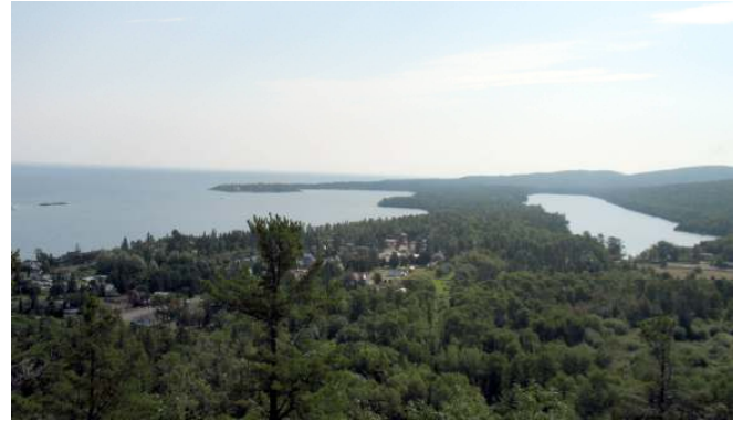
Copper Harbor and Lake Fannie Hooe from Brockway Mtn. Ft. Wilkins State Park is between these two bodies of water.

Friday, 9-26-14 – Travel to Copper Harbor. Camp at Fort Wilkins State Park