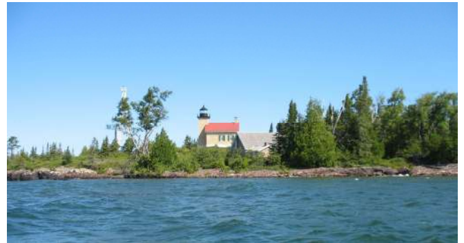
Copper Harbor Lighthouse as seen from the tour boat.

(Sandy and I will be heading back home Saturday morning 9-27, but caravanners may stay and play or travel to wherever your heart's desire.)