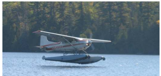
A sea plane braves a strong crosswind to land at the Lake Fanny Hooe “Splash In”, Saturday, Sept 26

Not mentioned were all the “happy hours”, individual dining experiences, shopping, hikes in the woods, exploring the fort, float planes, views of multiple lake freighters at one time, the Jampot, and more. Several of us agreed if you really wanted to explore the peninsula you could easily spend a week. And the camping facilities provide a great home base from which to base your day trips.