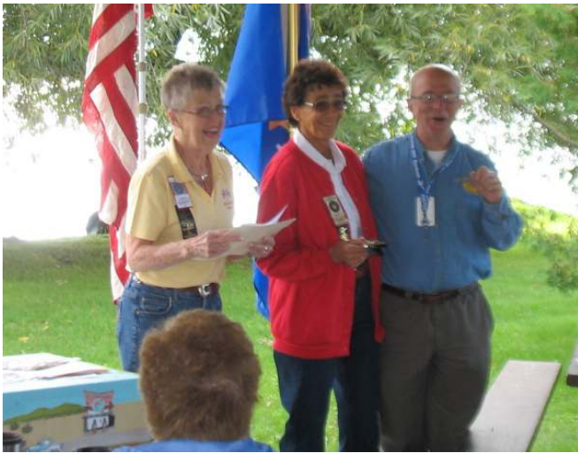
Our Region 7 Past Presidents planned a great installation!