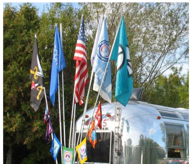
Suppose Ed has enough flags? (I count 12.)