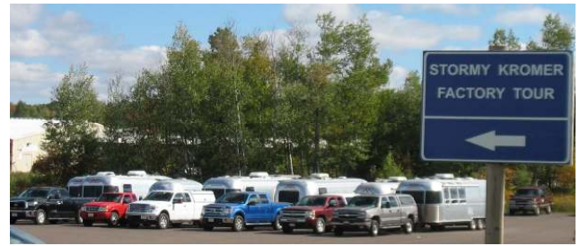
At the Stormy Kromer factory

Monday dawned with clear blue skies and warming temperatures. We had a leisurely morning at the campsite as our next appointment was a tour of the Stormy Kromer manufacturing facility in Ironwood at 1:30 p.m. Anyone familiar with the upper Midwest knows the Stormy Kromer hat is required headwear during our long winters. It was interesting to see our favorite hats being produced.