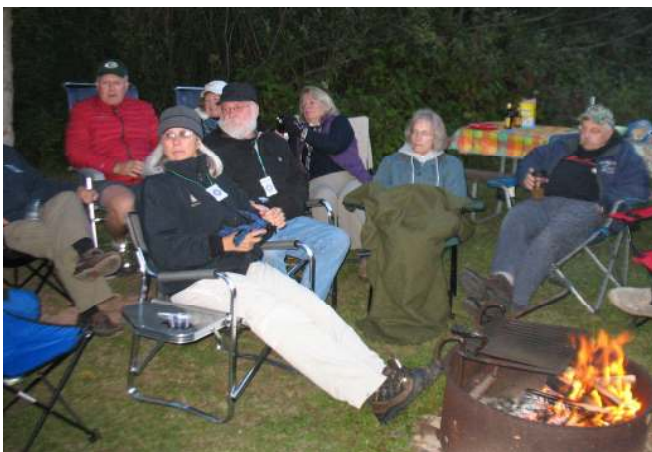
Chilly fall weather in the evenings

Friday and Saturday were for sightseeing, plus a fish fry Friday and group dinner at the Steak Pit on Saturday.