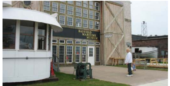
The Bayfield Maritime Museum was closed at the time of the 2011 Apostle Islands rally but has now reopened.