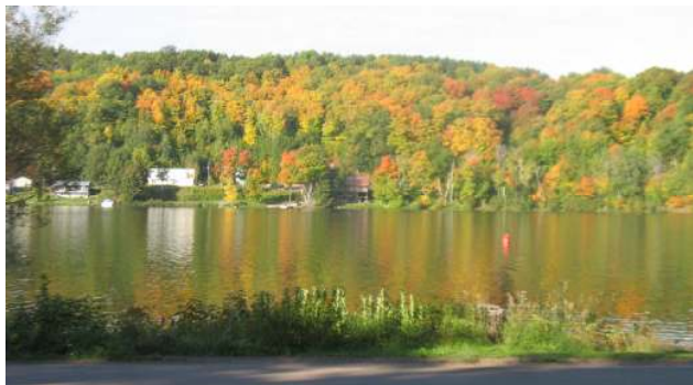
Portage River from Hancock Recreation Area campground