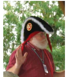
Our new Unit President is a man of many hats. . .