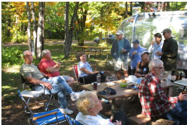
Happy hour at Fort Wilkins State Park

The two days in Houghton went quickly and it was time to move on to our final destination, Fort Wilkins State Park in Copper Harbor. Fort Wilkins is located on the shores of Lake Fanny Hooe and is a beautifully wooded campground with electric sites, a dump station, and bathhouse.