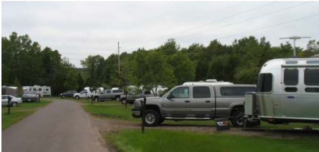
A long row of Airstreams under overcast skies

The Apostle Islands Adventure rally, hosted by George & Teri Boehmer, was one for the record books! Turnout was excellent, (16 trailers, if memory serves) including some Minnesota Unit members. Installation of officers was taken to new heights. (We can only speculate on what will be done next year to top it!)