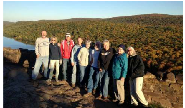
Lake of the Clouds overlook

Union Bay Campground is located on the shores of Lake Superior and provides electric sites, a dump station, and a bathhouse. The campground is on two levels, with the lower level campsites located on the shoreline. The sites are so close to the water that in a bad storm several weeks ago campers had to be moved from the lower level because of the large waves splashing across the sites. The "Porkies" are a 60,000 acre wilderness area with hiking trails, old growth trees, waterfalls, beaches and, when we were there, peak fall colors. The weather continued to be perfect. Clear blue skies, calm wind, warm temperatures (everyone packed cold weather clothes), and no bugs. A must-see is the overlook at Lake of the Clouds.