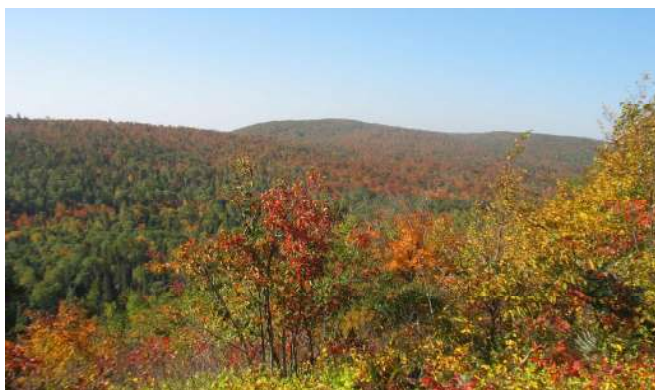
View from Brockway Mountain Drive

Friday night everyone dined as a group at the Harbor Haus German restaurant and spent the days exploring the area. A must-see is Brockway Mountain Drive which follows the ridge of Brockway Mountain and rises over 700 feet above Lake Superior. The views of the Keweenaw and Lake Superior, during peak color, were stunning.