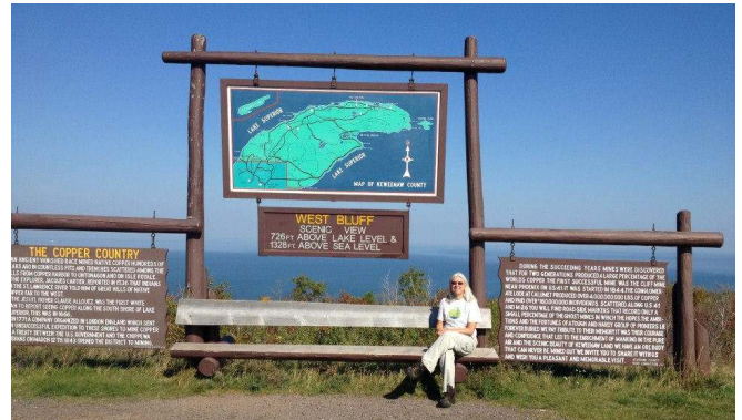
Brockway Mountain summit (Engelstad)

Some traveled to the downhill ski area Mount Bohemia and rode the chairlift, which operates for two weekends during peak colors, to the top of the hill for again, spectacular views of the peninsula.