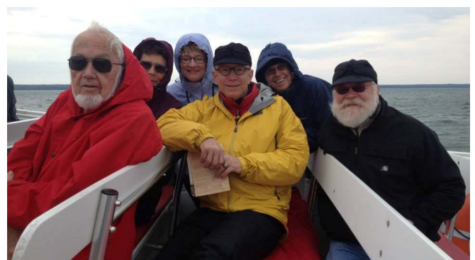
Hardy Airstreamers on the top deck of the Apostle Islands tour boat (Engelstad)