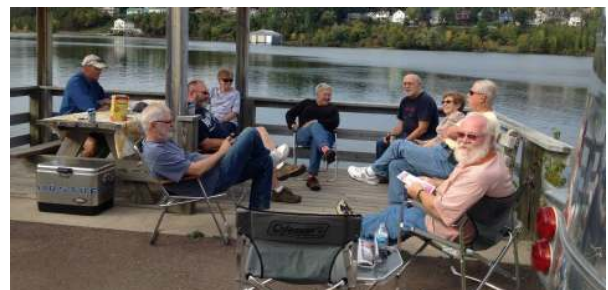
Happy hour at Houghton RV Park (Engelstad)

After two nights in the Porkies we departed for some urban camping at the Houghton RV Park in Houghton, MI. This campground is also on two levels with the lower level sites being waterfront. Each site has full hook-ups, a covered deck, and picnic table. The campground is within walking distance of the downtown area, eating establishments, and a brew pub. I believe this campground must be one of the best kept secrets in the UP. It is a good home base to explore the Houghton/Hancock and Keweenaw Peninsula area.