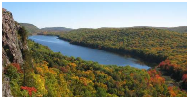
Lake of the Clouds, Porcupine Mountain Wilderness