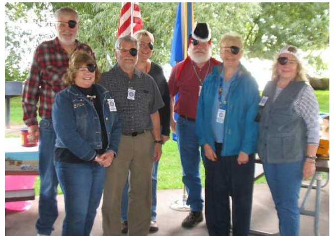
The whole motley crew!