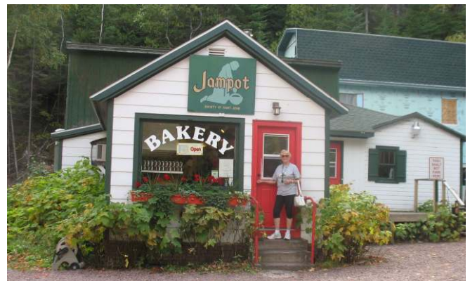
The Jampot—the premier bakery of the Keweenaw