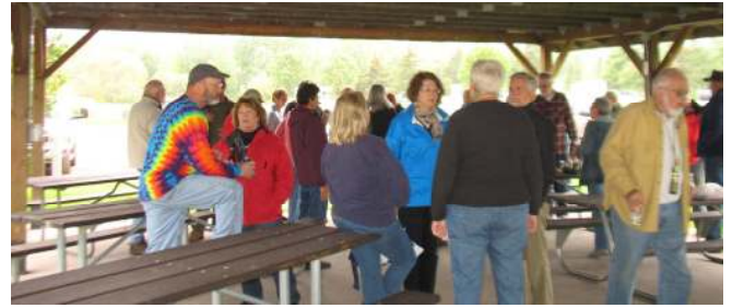
Friday happy hour in the picnic pavilion

Friday and Saturday were for sightseeing, plus a fish fry Friday and group dinner at the Steak Pit on Saturday.