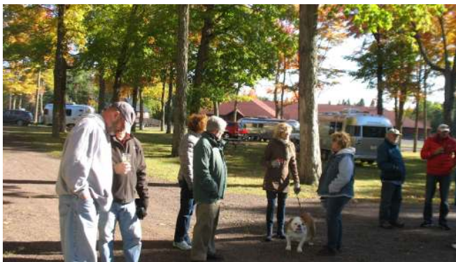
A beautiful Monday morning at Curry Park

While the weather for the weekend in Washburn was overcast and cool, it steadily improved as we traveled to our first stop in Ironwood Michigan. Arrangements had been made for us to spend the night at Curry Park located on US 2 in Ironwood. Road construction on US 2 made finding the park interesting, but everyone arrived in due time. Curry Park is located on the south side of the Gogebic County Fairgrounds and provides shaded sites with power, water, a dump site, and a bathhouse. That evening we dined as a group at the Bell Chalet located in neighboring Hurley, WI.