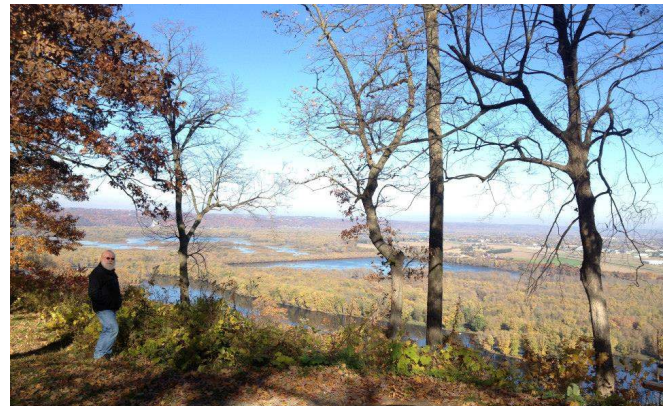
Overlooking the Mississippi, Wyalusing State Park.