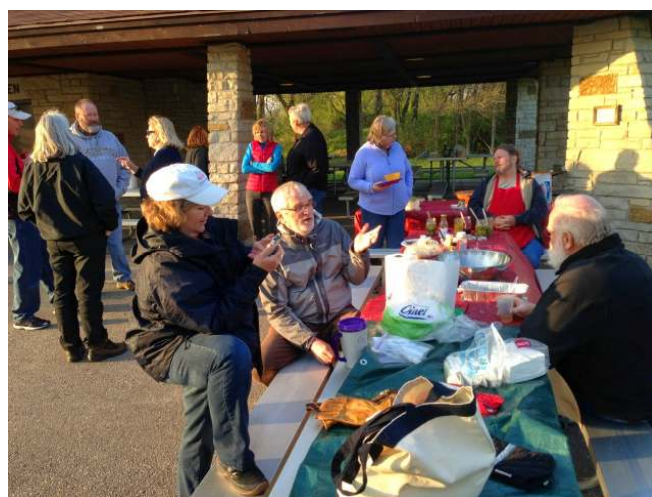
Capital Campout, Madison, Wisconsin, May, 2014

The Wisconsin Unit currently has 62 members from eight different states. We strive to have monthly activities for our members to participate in from luncheons during the winter months to Camp Outs, Rallies, and Caravans during camping season. Information on these activities is located in the monthly Badger Bulletin (after all, we are the Badger State), which you are currently reading.