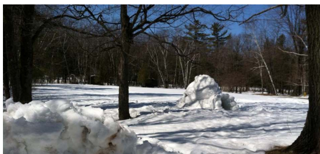
Igloo at the 2012 Easter Campout.

Winter has hit us early this year. We usually try to get out of the area for at least part of the winter months by taking our silver home on wheels down to warmer areas. A couple years ago, it was just about the same temperatures in Mississippi and northern Florida as it was in Wisconsin while we were there looking for sunshine. Our beautiful state had a warm winter, and the south had a cold one. I am betting that this year will continue on a different path.