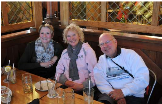
The well-travelled Uptons! Wonder if they made it back to the U P before the snow hit!