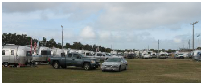
February 2012, Florida State Rally – Sarasota, Florida

Getting out of the cold is a good thing. Just ask our Canadian friends heading to warm places how nice it is to escape and join other snow birds and stop shivering.