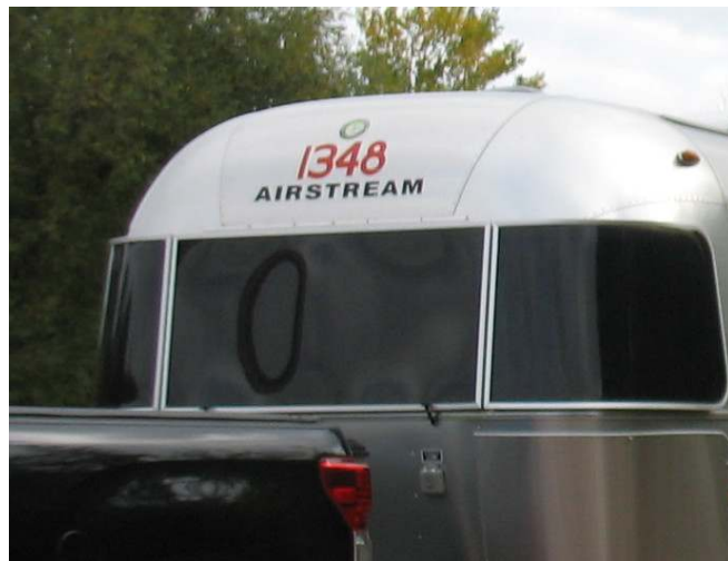
"Conventional" display of WBCCI logo and numbers.

This month let's talk about the "Big Red Numbers" - what are they?