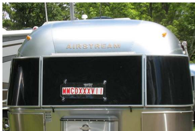
"Unconventional" display of WBCCI numbers.

When you become a member of the Wally Byam Caravan Club International (see "What is the WBCCI") you will be issued a membership number which can be displayed on your trailer - these are the Big Red Numbers. You will be listed in a membership directory by both your name and your membership number. As you travel about the country and encounter other Airstreamers you can check your directory before walking over and introducing yourself to a fellow traveler.