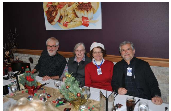
Some of our well-traveled members.

Conversation was lively; one couple was on their way home from a trip to the middle east, had come in from O'Hare the night before, and were still working their way home. Another couple had traveled to the Indian subcontinent this fall, and three members had been on the Southwest Adventure Caravan from Durango, Colorado to Santa Fe, New Mexico.