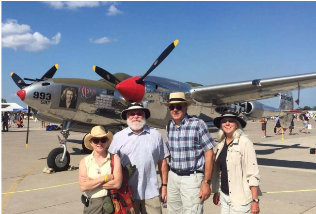
Our gang in front of a WW II P-38.

A small contingent of the Wisconsin Unit attended the Experimental Aircraft Association's annual fly-in, dubbed Airventure, which is held every year at Wittman Regional Airport in Oshkosh Wisconsin. Everyone in the world that is involved in aviation knows about "Oshkosh", as the fly-in is known, and it's on their bucket list to attend at least once in their lifetime.