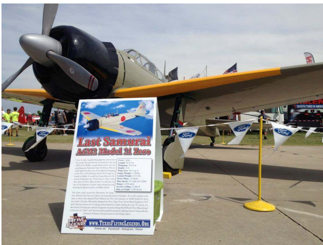
Some very rare (war) birds at Oshkosh. Here, one of the last Japanese Zeros of World War II still flying.

Though started in 1953 by a small group of people who came together with a common interest in constructing their own airplanes, the EAA has evolved into a large organization covering all aspects of aviation. Like the WBCCI's "Vintage" or "Classic" intra clubs, the EAA has divisions for Ultra Lights, Antique, Vintage, Warbirds, Aerobatics, etc. There are many local Chapters, technical advisors to assist homebuilders, flight advisors, as well as a Washington D.C. staff for Advocacy and Government Relations just to name a few of the organizations activities.