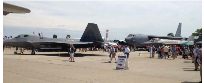
B-52, F-22, and F-35 all in one picture. Only at Oshkosh!

Airventure is EAA's annual convention - like WBCCI's International Rally. Some of the numbers for this years convention include: attendance of approximately 550,000 people, 10,000 aircraft arrived at Wittman field and nearby airports, there were 16,200 aircraft landings at Oshkosh, on Thursday alone there were 3,100 aircraft movements (takeoffs and landings) in 14 hours, 2,668 show planes attended including - 1,031 homebuilt aircraft, 976 vintage airplanes, 350 warbirds, 130 ultralights and light-sport aircraft, 101 seaplanes, 30 rotorcraft, and 50 aerobatic aircraft, there were more than 800 exhibitors including more than 140 new exhibitors this year