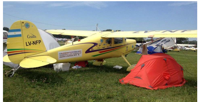
This Cessna 140 came all the way from Argentina—at a cruise speed of about 100 miles per hour.

Informational forums and hands on workshops had a total of 1,048 sessions attended by 75,000 people. The International Visitors Tent had 2,299 visitors registered from 80 nations, there were 970 media representatives on site from five continents, and EAA's 1,000 photo uploads were viewed nearly 8,000,000 times.