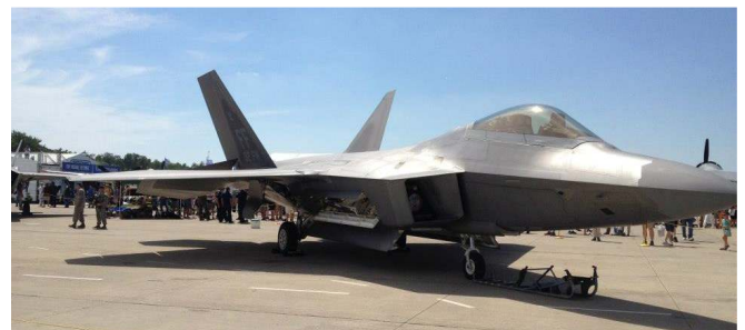
The old and the new. Latest generation F-22 fighter.