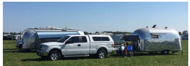
Airstreams way out in left field.