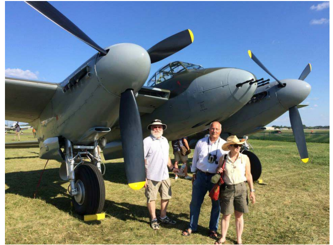
WW II British de Havilland Mosquito bombers. One of two still flying.