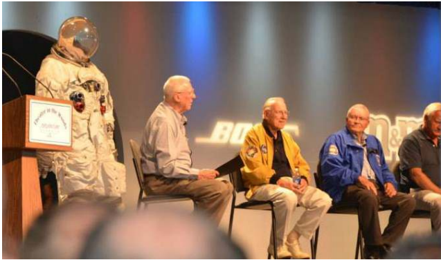
Apollo 13 astronauts tell their stories.