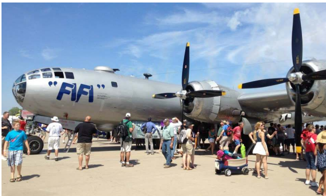
One of two B-29 bombers still flying.

We finished the day at the north end of the airfield among the Warbirds.