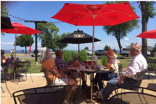
Lunch at the waterfront restaurant.