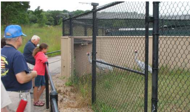
Visiting the cranes at the International Crane Foundation.

As the rally theme implied, the organizers scheduled a wide variety of activities, starting with a guided tour of the unique International Crane Foundation.