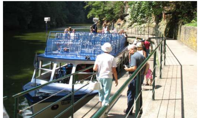
Boarding the boat after touring Witches' Gulch

Saturday morning was the Upper Dells boat tour with a walk up Witches' Gulch and Saturday evening was the trip to the Dells Raceway.