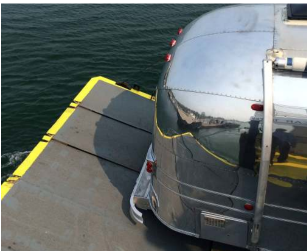
Ed's trailer "between the devil and the deep blue sea".