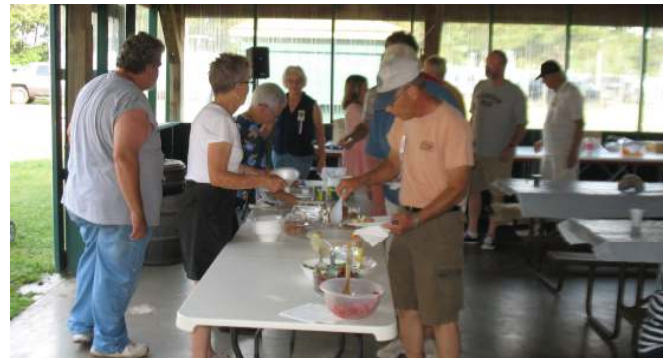
Region 7 officers serve breakfast in the pavilion.

This was a full-service rally from the standpoint of food—dinner was provided every night at the campground, the Wisconsin Opry, and the race track.