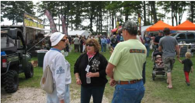
Airstreamers compare notes on what to eat and drink.

Saturday's main activity was the 4 th Annual Death's Door Barbecue competition, which brought dozens of professional barbecuers (is that a word?) to the island—along with their semi-sized barbecue trucks—more business for the ferry! Lots of good food and drink, and games for the kids.