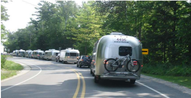
The first wave of trailers hits the ferry Thursday morning.