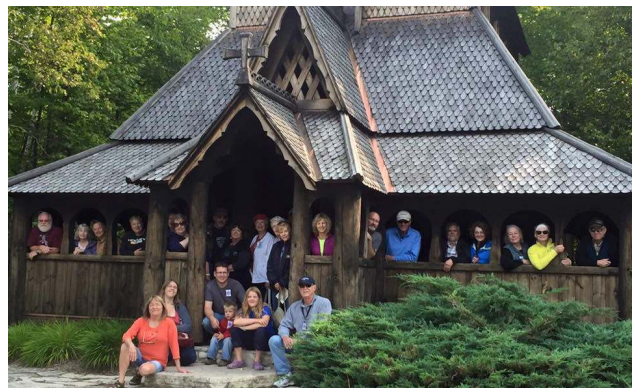
Our gang at the Stavkirke , a \frac{3}{4} scale replica of a Norwegian stavkirke built around 1100 AD, and still in existence.