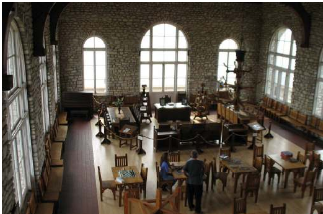
Viking Hall from the inside.