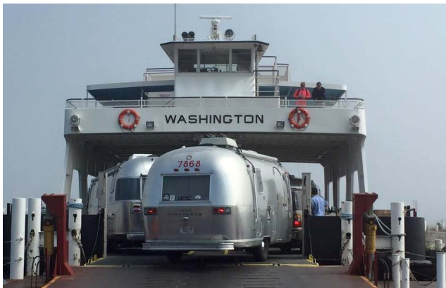
Are you sure this is going to fit? (It did, but they had to leave the gate down for the crossing!)

The Ferry Tales rally theme was prophetic. We all ended up with tales to tell of our adventures with the ferry.