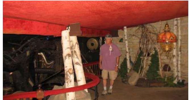
Wandering through The House on the Rock