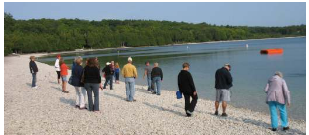
Schoolhouse beach is a rare dolomite stone beach. Having been smoothed by the glaciers, the rocks are irreplaceable—$250 per rock fine for taking them.