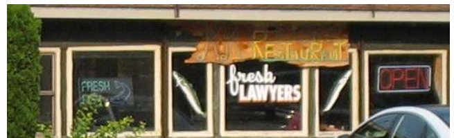
Restaurant advertising "Fresh Lawyers". Lawyer being the local name for a fish, a.k.a. burbot or eelpout .