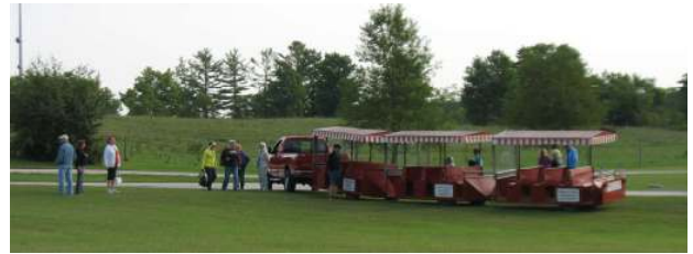
Boarding the Cherry Train tour tram Friday morning

Being old Washington Island hands, Dave & Vicki planned a schedule of activities to "hit the high spots" of the island.