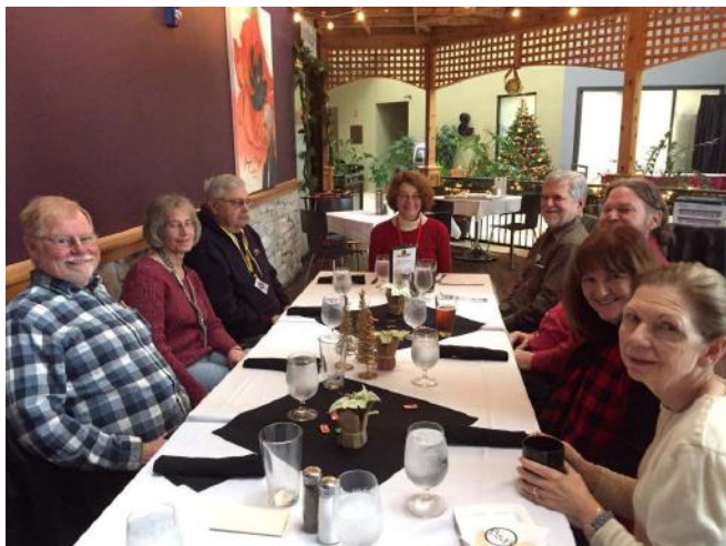
Our illustrious bunch

The Wisconsin Unit gathered at Buck and Honey's Restaurant in Sun Prairie for our December Holiday lunch to celebrate Christmas, Solstice, Bodhi Day, Hanukkah, Id al-Adha, Day of the Return of the Wandering Goddess, Saturnalia, Yule, Zartusht-no-diso, Shabe-Yalda, Festivus, Kwanza, and Omisoka. (If we missed your favorite holiday celebration, talk to the editor, he limited my report to less than ten thousand words.) We had eighteen members show up for the festivities, including the magical bakers who provided everyone with their own sweet and tasty Airstream to either eat or take home.