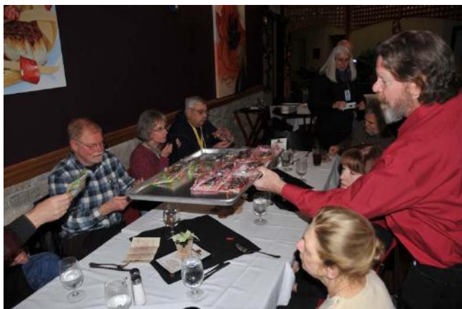
Those look interesting—wish we had a close-up picture.

We look forward to seeing some if not most of you at our next Luncheon, February 13 th , at the Spring Garden Restaurant in Waunakee. The winter luncheons are a great time to make new friends, catch up with old friends, and associate with those unique people that are part of the Wisconsin Airstream family. We also hope you will mark your calendars to attend the Easter Campout Opener at Peninsula State Park in Door County.