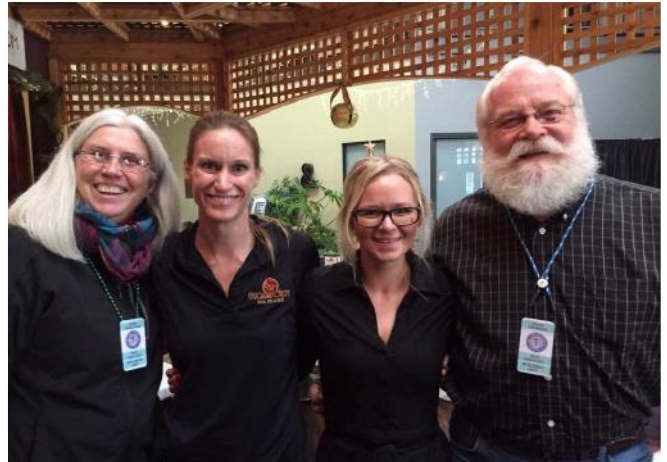
Our much-abused servers. (Hope they got a generous tip!)

The serving crew was well suited to our group, giving as good as they got when it came to smart remarks.