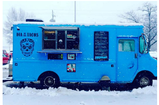
Any day is Dia de los Tacos —even in the winter!? (Extra hot sauce, please!)

Like food trucks? There now are four food trucks in Marquette! These include: Dia de Los Tacos , Señor's Food Truck , Wild Blue BBQ , and Copper Crust .