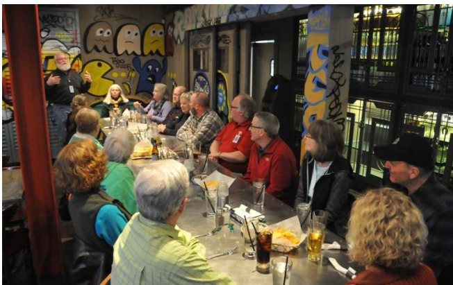
The Pac Man art must be part of an overall "vintage" motif.