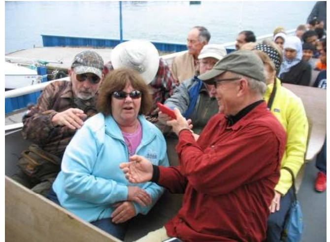
A few of our merry band on the boat