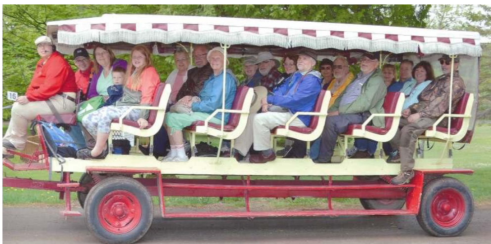
Carriage load of happy campers!