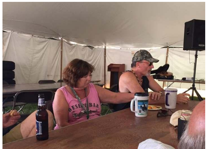
Chillin' with Antsy