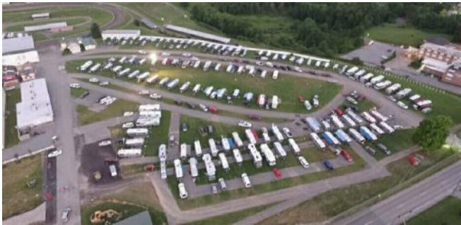
Aerial photo of the fairgrounds and a few of the trailers (Most of the trailers were on the other side of the road.)

This year's International at Lewisburg was one for the record books, in more ways in one. Attendance, at 660 trailers, was more than twice the previous year's International—and would have been more, except that it was also the first International in an official disaster area!