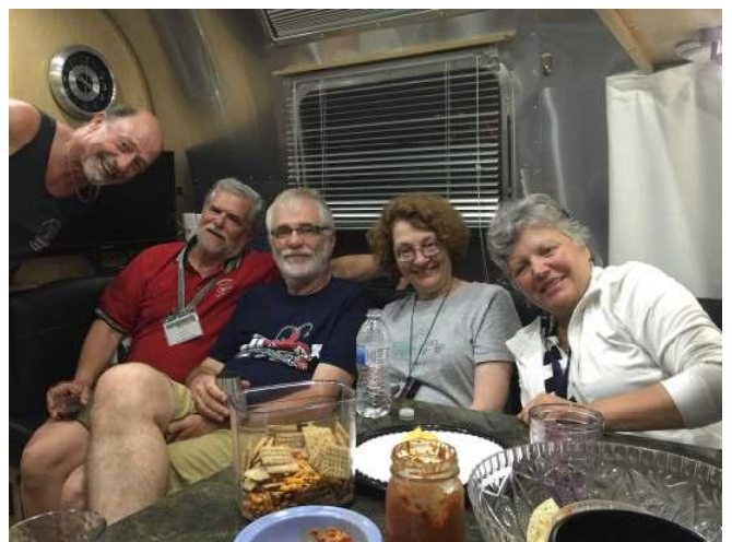
Happy hour in the Airstream