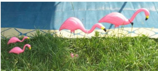
In the vintage area, the flamingoes were hatching!

The fairground has a huge field on the west side of the highway, with a bunch of new full-hookup campsites. We were in the “west” campground. When Mike Rice told