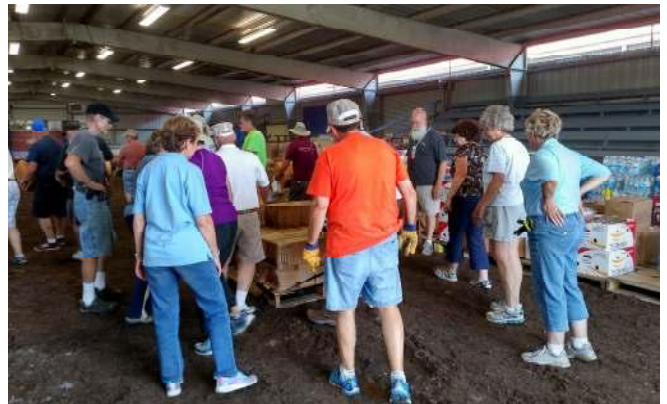
With 30 or 40 people we could break down a pallet and carry the contents to their respective piles as quickly as the fork lift could unload them.