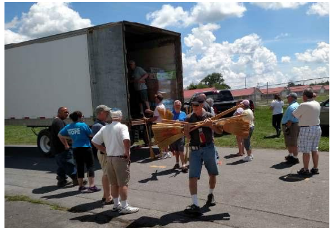
This trailer had a load of loose brooms on top of the pallets.

Among other things WBCCI members provided hundreds of hours of labor to flood relief efforts. Some, who were members of Habitat for Humanity and Samaritan's Purse went into the flooded areas and helped directly. The fairgrounds served as a depot for flood relief supplies and many helped unload incoming semis and load up pickups and SUVs taking supplies to the flooded areas.