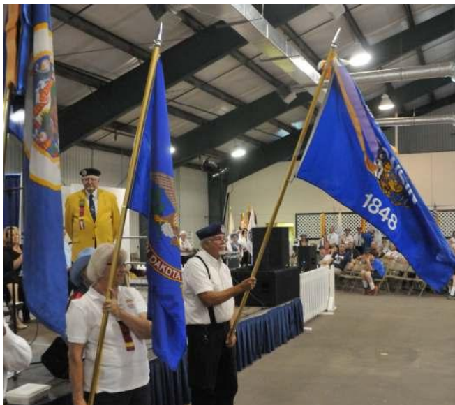
Wisconsin Unit was represented in the opening ceremony.