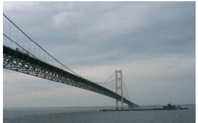
Approaching Da Bridge from the water side.