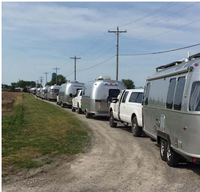
Lined up to get into Alumapalooza

The next night the caravan joined several other Airstreams at Fort Loramie State Park, Ohio.