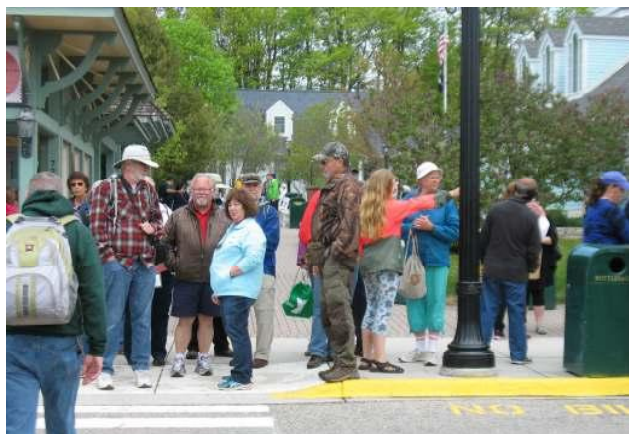
Lined up for the carriage on the island

Upon arrival on the island we were greeted with the unique characteristic smell of the town, a combination of fudge and horse manure.