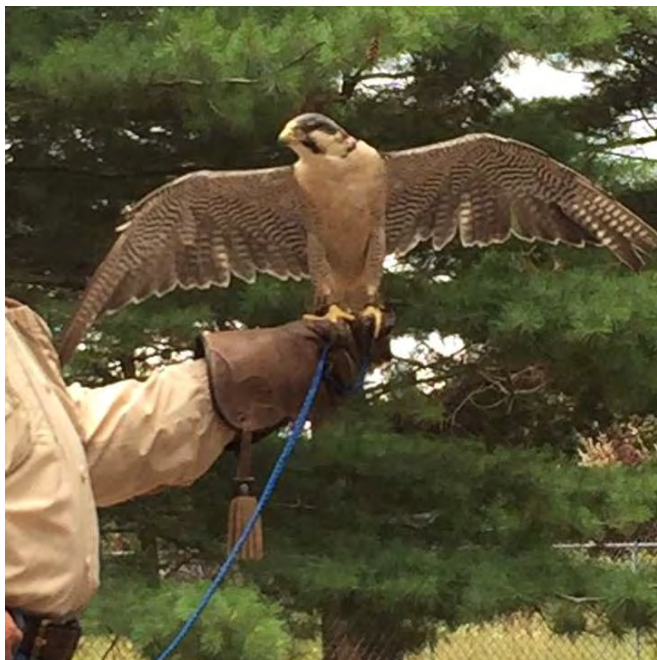
One of the residents of the Chocolay Raptor Center.

The Fish Hatchery tour, History Museum tour, lunch truck and potluck were all well-attended.