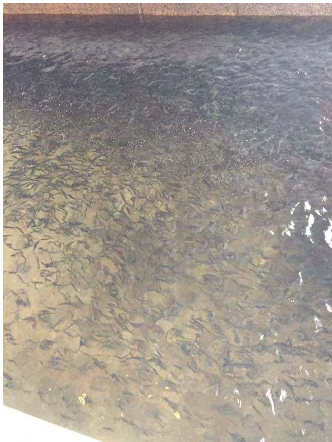
That's a lotta fish!

The Fish Hatchery tour, History Museum tour, lunch truck and potluck were all well-attended.