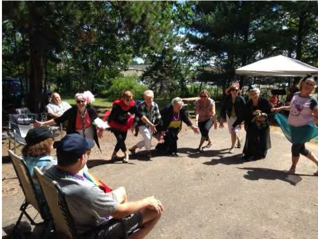
Faithful (?) ladies-in-waiting perform abdication ceremony.