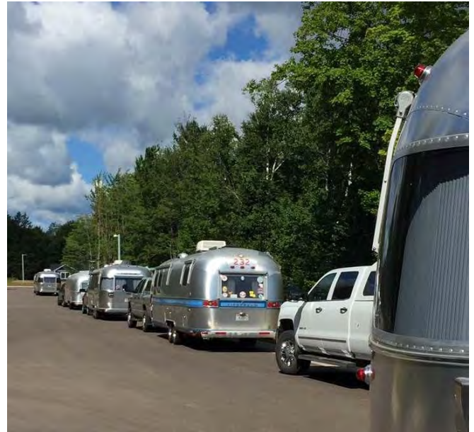
Jane’s neighbors probably wondered what was going on!

The rally was concluded with Sunday brunch at my house.