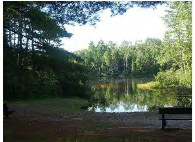
Widewaters camp ground

Your fellow members spent a couple of nights prior to the Marquette Mardi Gras as boondockers. We had sites in the Wide Waters Campground in the Hiawatha National Forest.